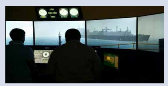
SEAMASTER training picture

and training for seafarers, shore based personnel, ports and Government agencies. It is also the founding member of the Aviation, Maritime and Oil & Gas EduHub @ Aeropod KK (A.M.O.G), currently the only EduHub in the region for all 3 industries colocated within a centralized location.