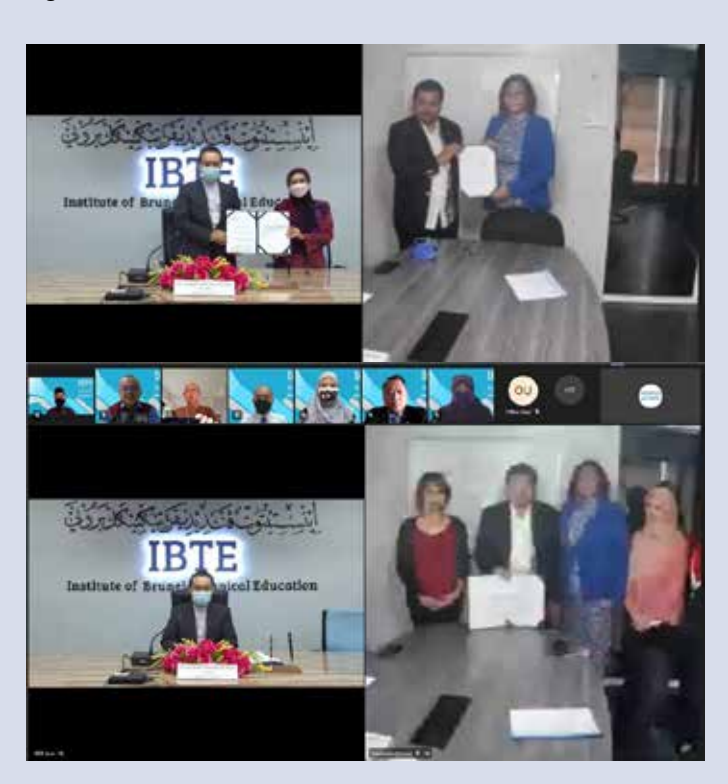
Signing of the MOU wiitnessed by IBTE Management Team and SEAMASTER representitives

The MOU was to establish a basis of cooperation and collaboration as well as working relationship in the fields of research, education and training in the fields of maritime, ports, shipping and marine logistics of mutual interest between the IBTE and SEAMASTER.