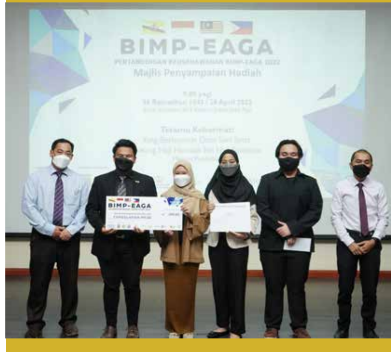
The IBTE Team made it to the shortlist, one out of nine teams out of 43 teams that joined the competition.

Launched In 1994, the BIMP-EAGA initiative boosts growth in trade, investments, and tourism through new intra-region shipping routes and air links as well as power interconnection projects. Other key areas of cooperation include agribusiness, tourism, the environment, and socio-cultural education.