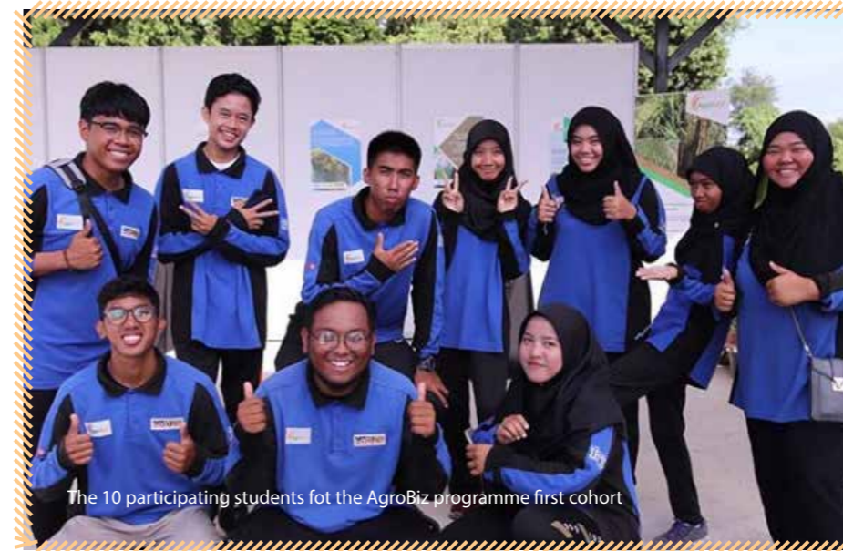
The 10 participating students for the AgroBiz programme first cohort

The lot's irrigation system harvests rainwater from several roofs around the campus channeled into