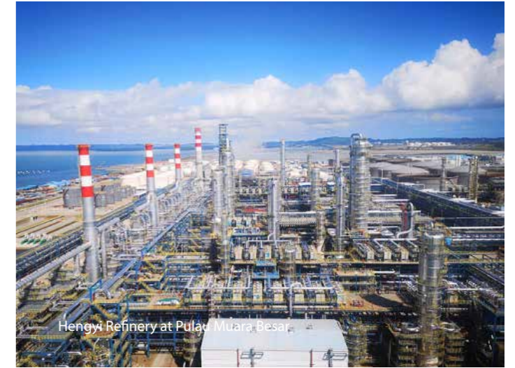
Hengyi Refinery at Pulau Muara Besar