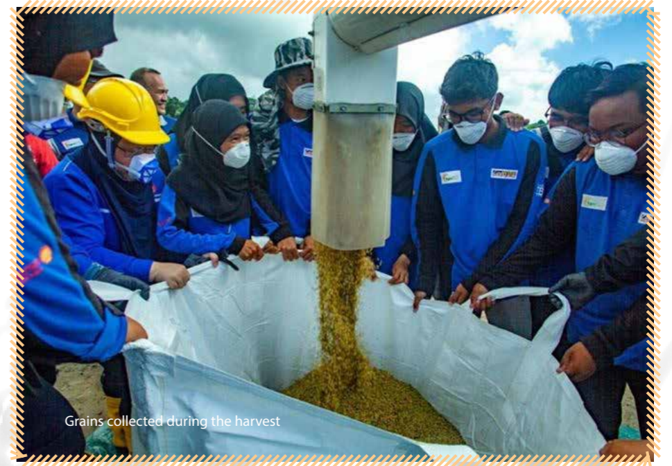
Grains collected during the harvest

The yield of the planted Sembada188 from the 10-hectare plot at the IBTE Agro-Technology Campus in Kampong Wasan exceeds AgroBiz's target for four to five MT per hectare, and is being attributed to the site's irrigation infrastructure and use of pesticide-free and organic fertilisers which were deployed using modern methods including drones.