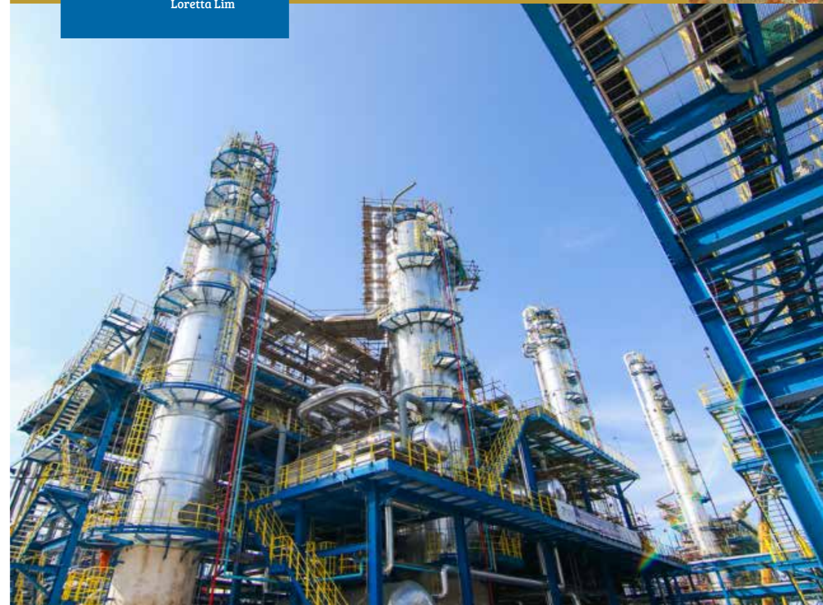
A shot of Hengyi integrated Oil Refinery and Aromatics Plant at Pulau Muara Besar (PMB).

The Hengyi project on Pulau Muara Besar is expected in creating about 780 job opportunities. The facility will be producing petroleum products such as gasoline, diesel, Jet A-1 fuel and petrochemical products like paraxylene and benzene. The Hengyi programmes that are conducted at IBTE Jefri Bolkiah Campus, is a three-year programme that comprises of twelve months of institutional-based training at IBTE Jefri Bolkiah Campus, twelve months of institutional-based training at Lanzhou Petrochemical Polytechnic in China; and twelve months of on-the-job training at Hengyi Petrochemical Plant at PMB will be offered employment opportunities at Hengyi Industries.