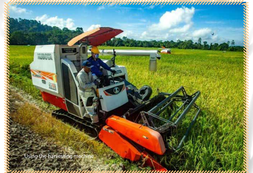
Using the harvesting machine