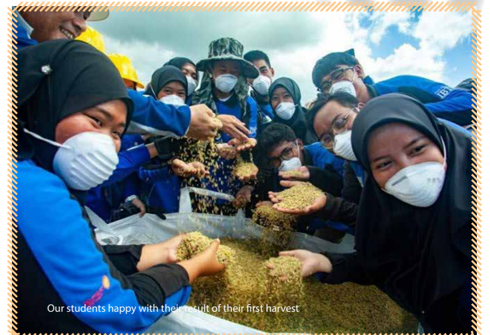
Our students happy with their result of their first harvest