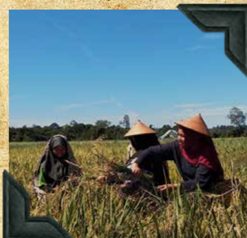
The National Day Photoshoot

Our first batch of IBTE students from HNTec AgroTechnology specializing in Rice Industry, spent a day pretending of what it would be like to be paddy farmers in the bygone days during their photoshoot with LIVEWIRE to commemorate the 36th National Day of Brunei.