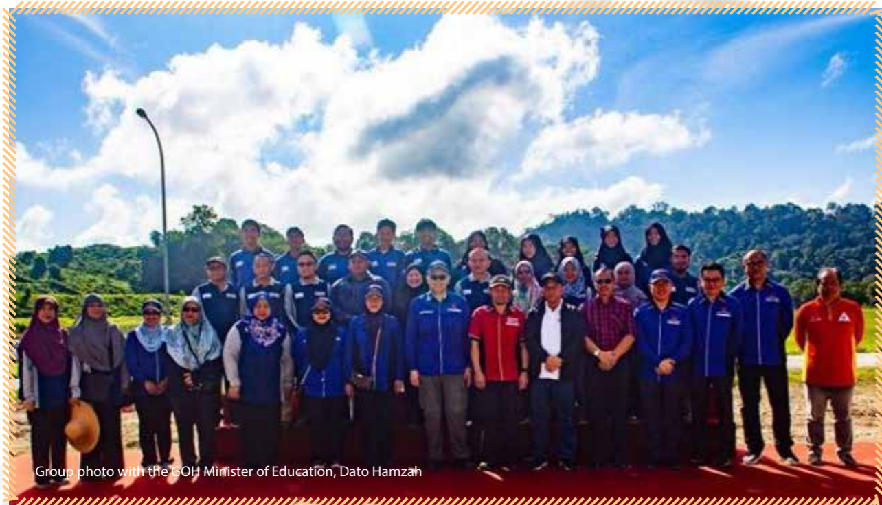
Group photo with the GOH Minister of Education, Dato Hamzah