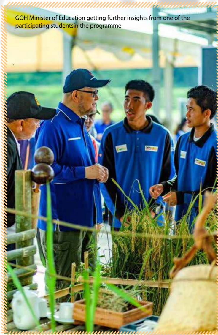
GOH Minister of Education getting further insights from one of the participating students in the programme