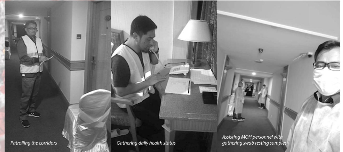
Patrolling the corridors

7 May - Interview sessions for applicants who were short listed for the July 2020 Intake. Due to the COVID-19 situation in the country, precautions were taken to ensure the safety of the applicants as well as IBTE personnel. The interview session were spread out over a three-week period, all applicants had been allocated a time and date to attend the interview. On the day of an applicant's interview, temperature checks were taken and a health declaration form were filled in at every entrance before the applicant was allowed to head to the holding room where all of their original documents were to be checked against what the applicant had inputted in their respective TVECAS form, and the applicant then waited for their turn before heading to the interview room. This applied throughout all IBTE Campuses.