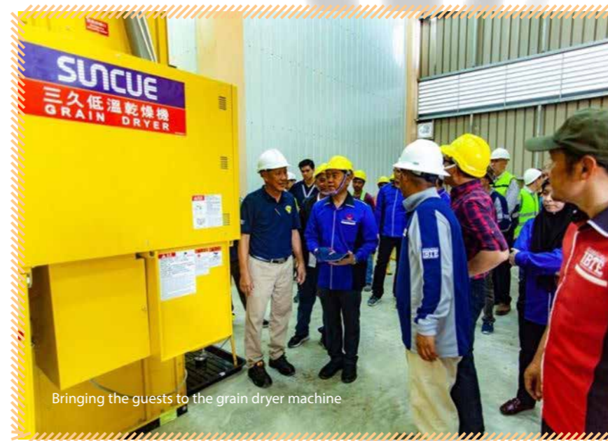
Bringing the guests to the grain dryer machine

"The course is comprehensive covering land selection, to land preparation, leveling, treatment of soil, preparation of seeds, planting, treatment, harvesting and milling," he said. "Our hopes are very high for this programme; farmers are aging in Brunei, and there need to be more young talent in this field to continue to grow the industry."