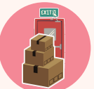
Blocked fire exits