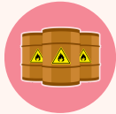
Improper storage of flammable materials