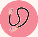
Faulty Wirings or Damaged Electrical Equipments