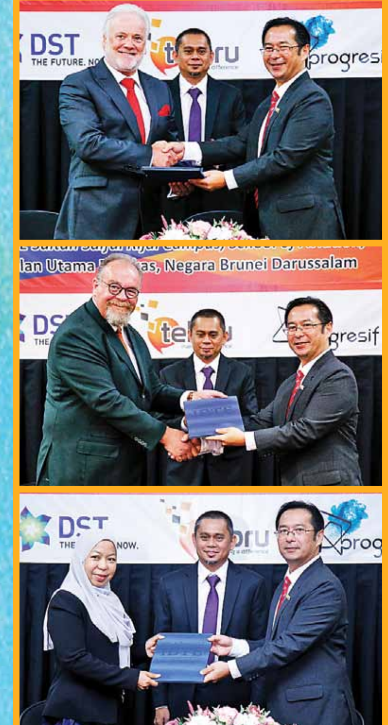
MOU DOCUMENT HANDOVER BY IBTE DCEO (DEVELOPMENT)

As for the telecommunications industry, students will undergo an on-the-job training at DST Communications Sdn Bhd, Progresif Cellular Sdn Bhd or Telekom Brunei Berhad (TelBru) during the course of their study.