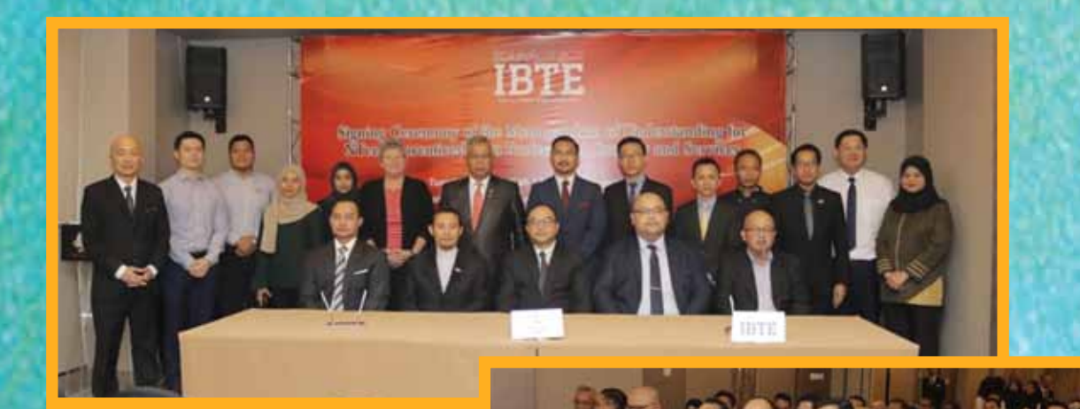
IBTE MANAGEMENT TEAM AND REPRESENTATIVES FROM FOOD AND BEVERAGES INDUSTRY

IBTE SIGNS MEMORANDUM OF UNDERSTANDING WITH FOOD AND BEVERAGES, TELECOMMUNICATIONS, AND AUTOMOTIVE COMPANIES