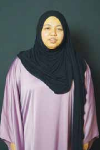
LA ROSE DES BONBON run by Rosymah Abdullah is an online dessert shop specializing in various types of bakery ranging from brownies, chocolate chip cookies and cakes.

4S ENTERPRISE business is on food blogging and reviews. Nysa Shah the founder of 4S promotes the food from restaurants or small businesses by advertising it on Instagram and website