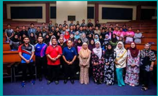
IBTE Legal Office held a talk on Sexual Harassment for the staff and students at School of Aviation. They covered topics such as, what is sexual harassment, how to identify sexual harassment, how sexual harassment can affect you, how sexual harassment becomes sexual assault, steps to take if you are sexually harassed.