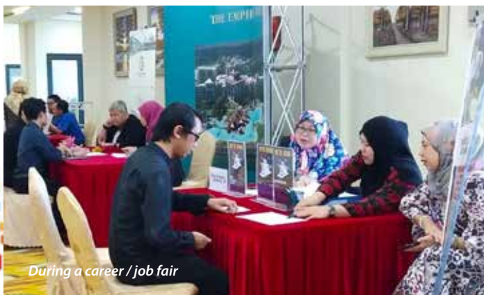
During a career / job fair