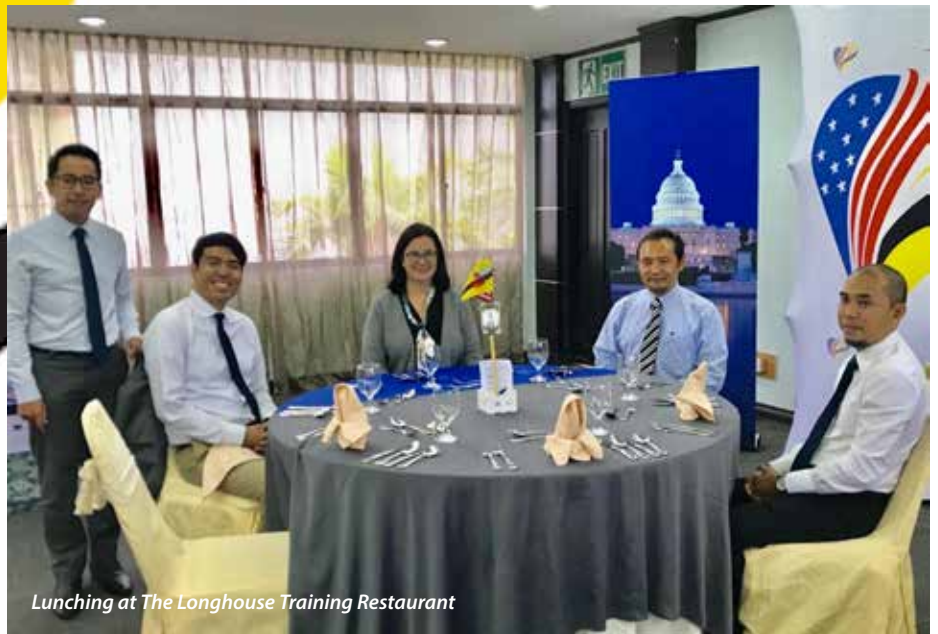
Lunching at The Longhouse Training Restaurant