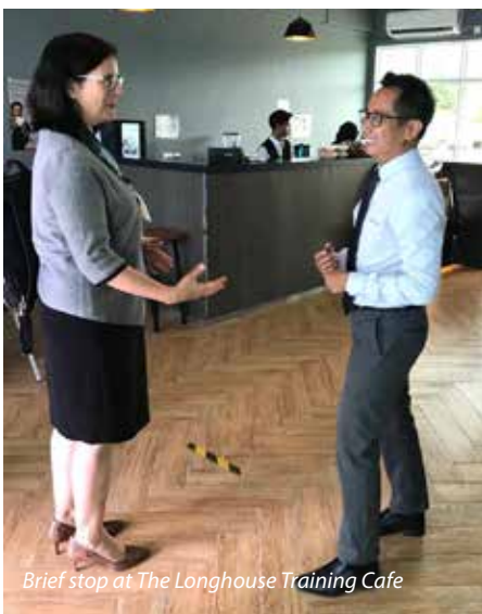
Brief stop at The Longhouse Training Cafe