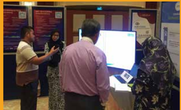
An Engagement Day was held for the Registered Training Organization (RTO) at the Banquet Hall, Prime Minister Office. Two speakers from IBTE Registrar Office presented on the Course Details and RTO Registration Process. The event provided an opportunity for the local companies to have knowledge on the guidelines and the registration process in becoming an RTO that enabled them to deliver IBTE programmes.