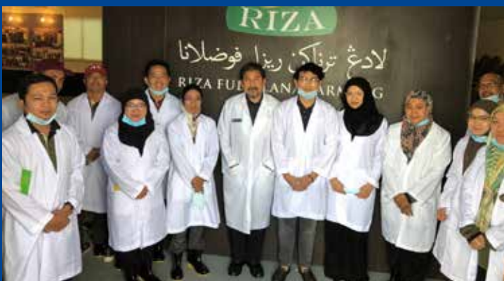
School of Agro-technology & Applied Sciences led by the Head of School and accompanied by instructors and support staff of the school went to visit Riza Farming (Broiler Producers) at Babatik Kilanas, Pro-Access Agriculture (Durian Musang King Farm) at Kiudang, Tutong, and HTG Services (Landscape provider) at Sinaut, Tutong to gained knowledge and insights of local large agricultural businesses in Brunei and to discuss the crop/ animal production, building & land infrastructure, local employment and students industrial attachment.