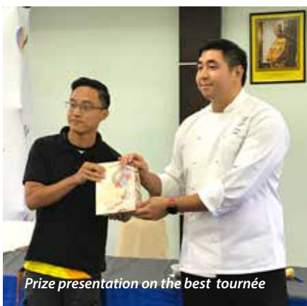
Prize presentation on the best tournée