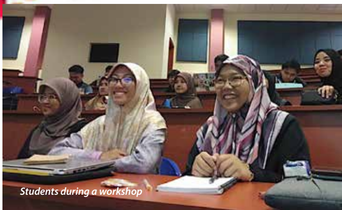
Students during a workshop

The Division's long term goal is to improve the employability of IBTE graduates and helping to develop the nation.