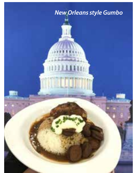
New Orleans style Gumbo