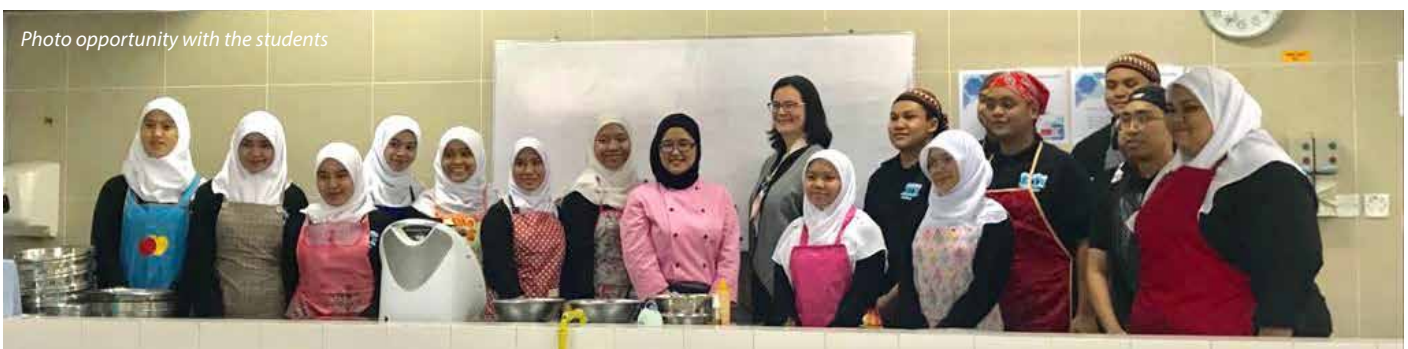
Photo opportunity with the students