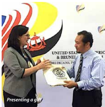
Presenting a gift