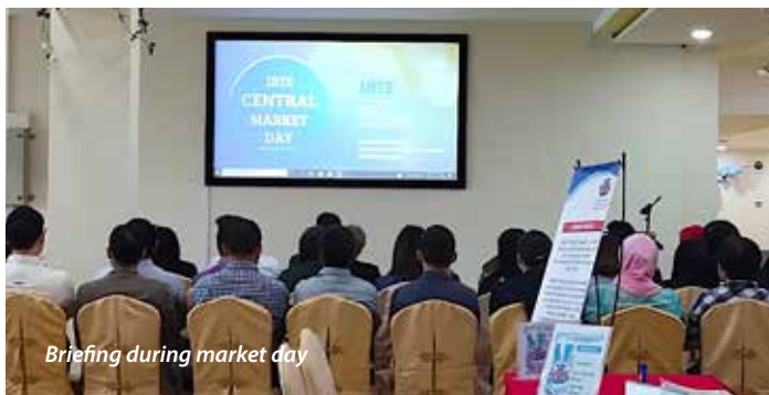
Briefing during market day