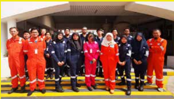
Students doing HNTec Mechanical Engineering visited BLNG. The students learned about the LNG production, the teaching aids used for maintenance engineering technicians in BLNG, and the safety aspects on the rotating equipments. The students also visited the BLNG mini plant, the mechanical workshops, and the process and utilities operations. The students spent a whole day at the facilities and a big thank you to BLNG for warmly welcoming and accomodating our students in their learning journey.