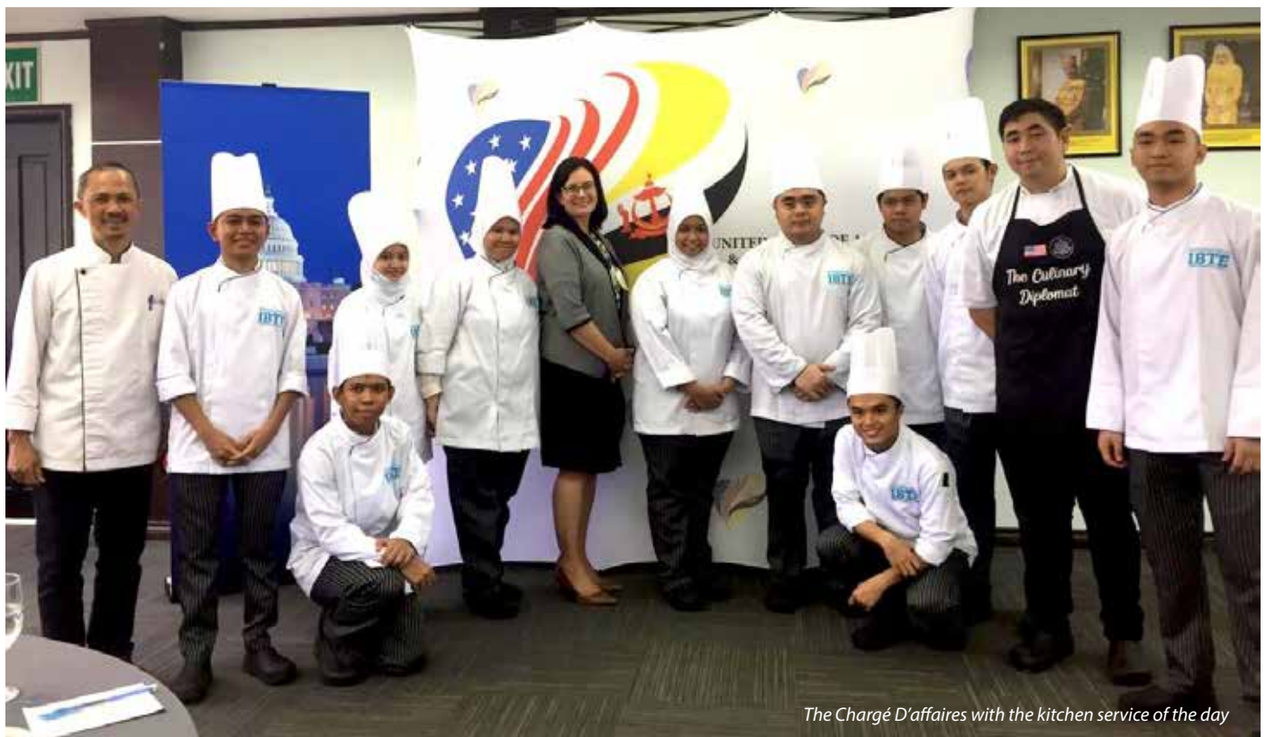
The Chargé D'affaires with the kitchen service of the day