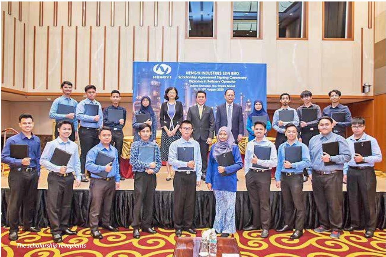
The scholarship recipients